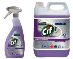
Cif 2in1 Cleaner Disinfectant